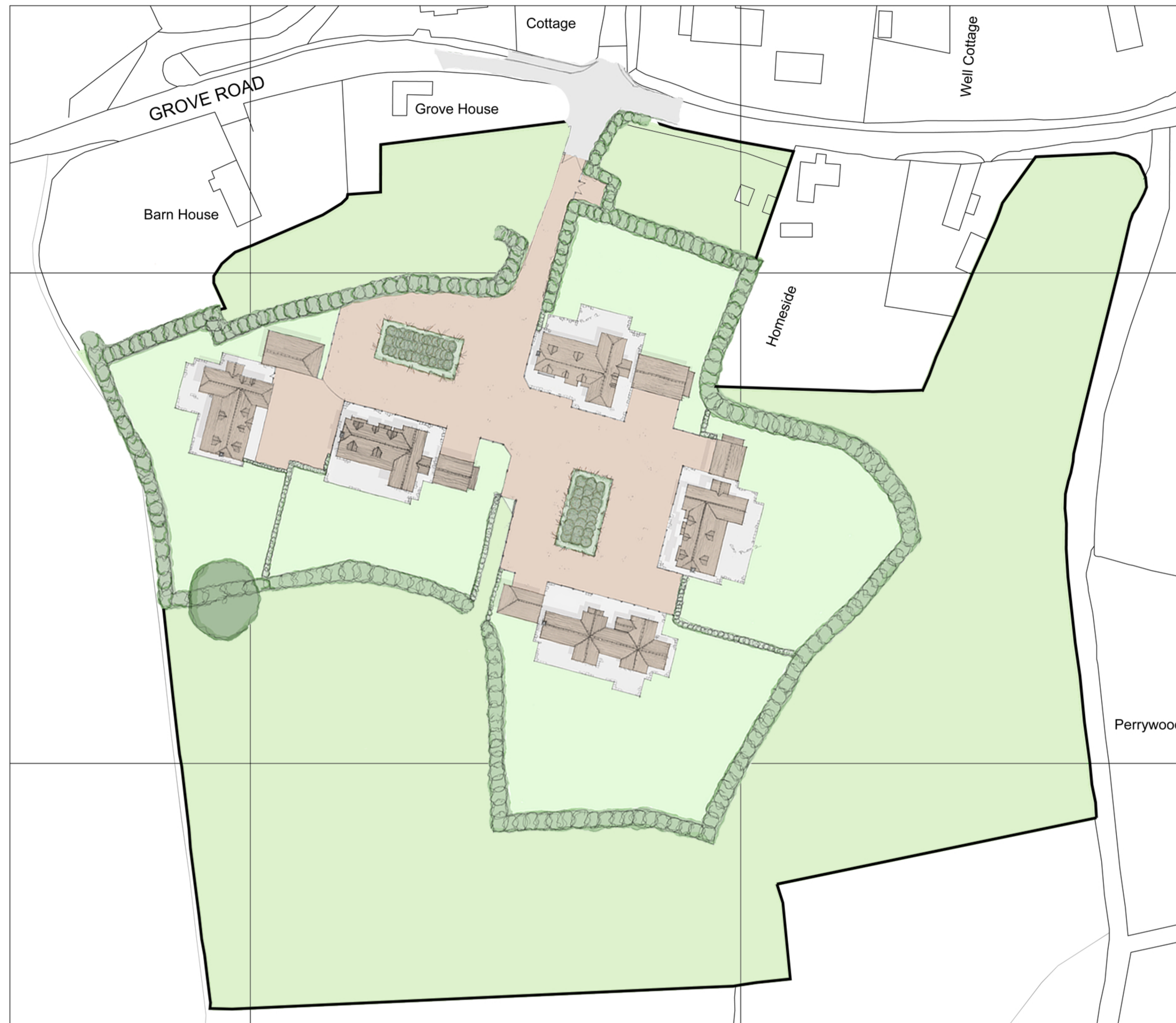
1:500 Block Plan